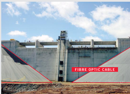
Midlands Dam, rockfill dam, Mauritius Leakage detection at the joint asphaltic facing / cut-off wall

Modern fibre optic temperature sensing methods enable temperature measurements along an conventional optical fibre of up to 110 km of length. Therefore, they are extremely suitable for the surveillance of dams, dikes and other hydraulic structures. Integrating an optical fibre already in the structure of a new construction or within the scope of a rehabilitation, the temperature can be measured readily along the inexpensive optical fibre and emerging leaks can be detected exactly.