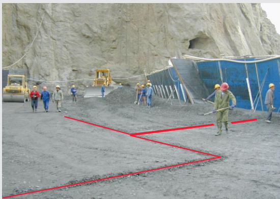
Installation of the fibre optical cable in Shimenzhi RCC dam (P.R. of China) in 2000

Using hybrid fibre optical cables the Heat Pulse Method can be applied to estimate the distribution of the thermal conductivity and the specific heat of the concrete along the cable in situ.